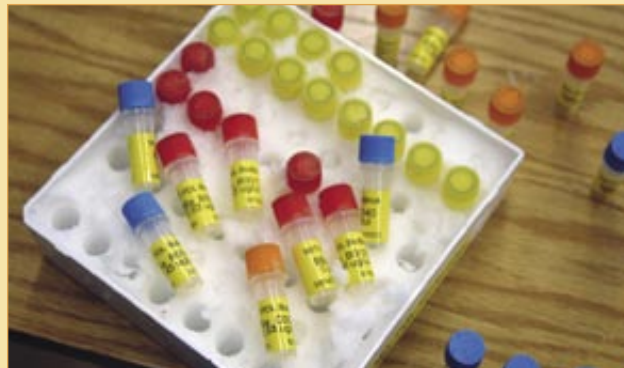
BIOBRICK VIALS contain DNA parts for biological engineering. These are safe for use in the lowest-level biosafety laboratories.

Right now scientists can certainly take the same precautions, such as working in secure biosafety laboratories, and observe the same ethical codes that have served us well for 30 years. Of course, ensuring that responsible investigators behave responsibly is easy. But the possibility that one day widespread access to DNA synthesis capability could allow malefactors to create deadly new pathogens, for example, is also a concern. It has prompted one of us (Church) to propose a compliance monitoring system that might include registration of synthetic biology workers—